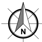
1 ELECTRICAL POWER AND LIGHTING PLAN - AREA B - MEZZANINE LEVEL 1/8" = 1'-0"

REFER TO ARCHITECTURAL DRAWINGS FOR ADDITIONAL PHASING INFORMATION.